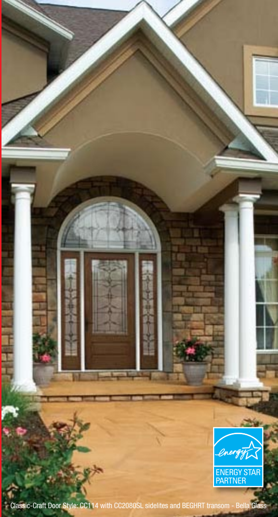
Classic-Craft Door Style: CC114 with CC2080SL sidelites and BEGHRT transom - Bella Glass