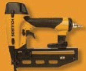
FN1664K 16 Gauge Finish Nailer

For nearly 40 years, Stanley-Bostitch has designed its products to be the most reliable & durable pneumatic tools available. Maybe that's why more finish carpenters and serious woodworkers rely on Stanley-Bostitch products more than any other major brand.*